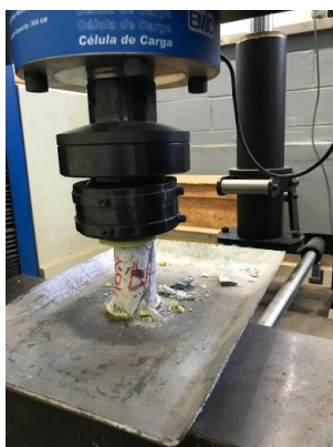
Fig. 5. Rupture of specimens.