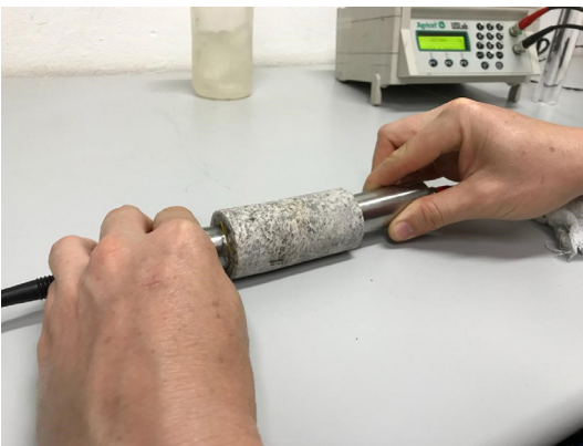
Fig. 3. Ultrasound testing.