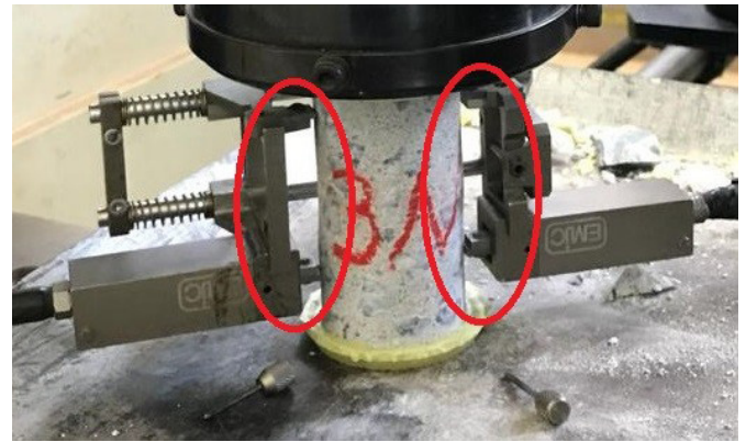
Fig. 6. Modulus of elasticity test.

diameter, which shows that they were satisfactory carved. Besides, the height/diameter ratios are approximately 2.0, which meets the requirements of ABNT NBR 12024 (2010).