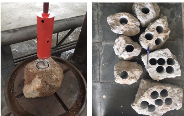
Fig. 1. Extraction of specimens.

The procedure for extracting the specimens complied with the criteria stipulated by the standard ABNT NBR NM 7680 (2015). A diamond cup saw was used to extract the specimens, with the following cup dimensions: 50 mm outside diameter x 44 mm inside diameter x 116 mm height. Figure 1 shows the process of the extraction