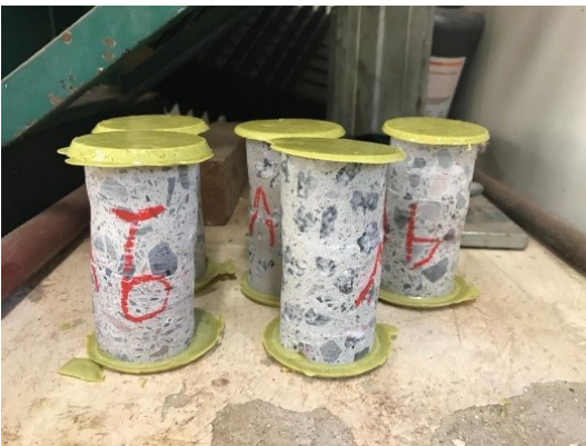
Fig. 4. Capped specimens for compression tests.